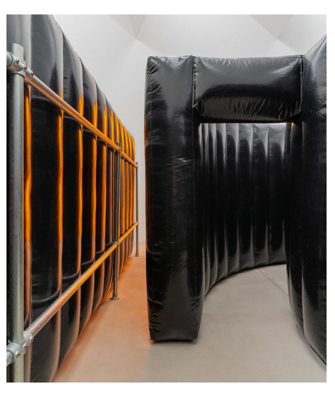
Devotion Strategy pt.2 (braced version), 2023

hips, movement comes into the arrangements: Expansion and limitation interact with each other and become part of the architecture. Volumes leap out of the wall and project into the space. They occupy its height vertically or extend horizontally, finally detaching themselves from the wall in favour of the free-standing work Production of Absence . Here our line of vision changes: we now look down from above on a brownpainted floor object with milled structures and openings. Its composition and its simple ornamental elements are reminiscent of architectural models and city plans or of effect devices used to change audio signals in music. In this sense, the floor work oscillates between sobriety and playfulness. It combines pure painting with sculptural form, which opens up the view of the negative space and, as it were, of something absent and not least exposes Vorisek's artistic methods.